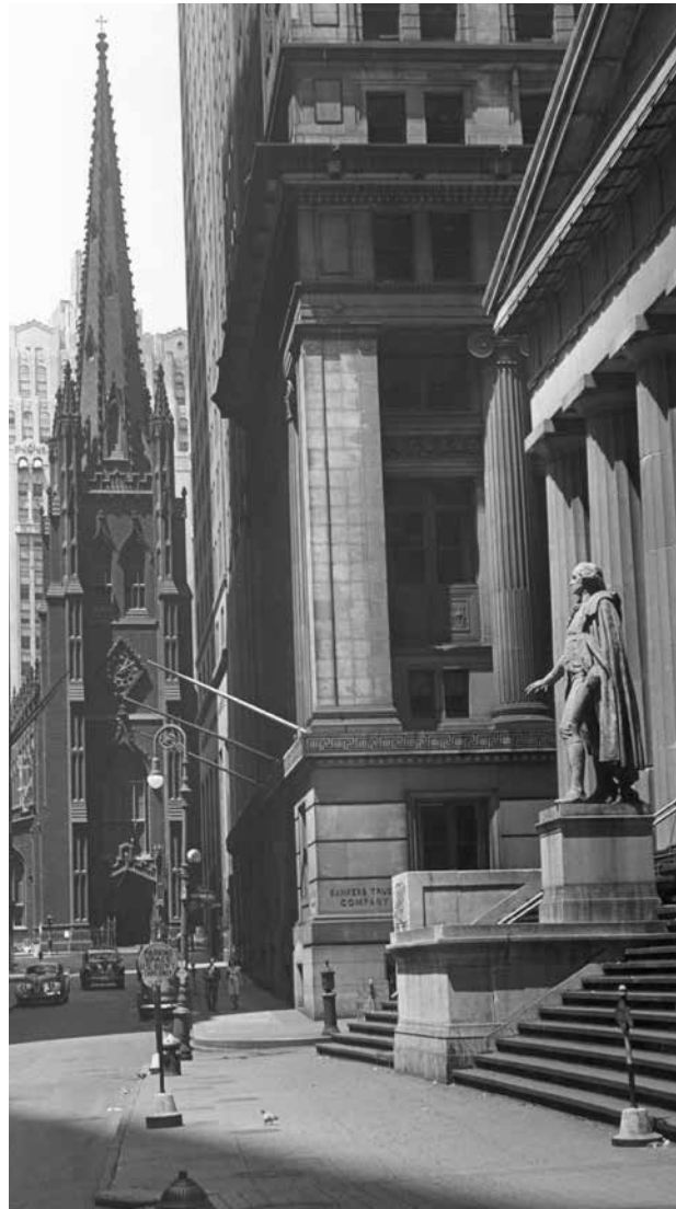
Wall Street expertise.

Calendar year 2019, was the most significant in our 18-year history. In January 2020, MillRiver Wealth Management completed the purchase of The New Hampshire Trust Company of Keene, thus uniting MillRiver, and The New Hampshire Trust Company to form NHTrust . The expansion resulted in an increase to $1 billion in assets under management serving over 5,000 clients.