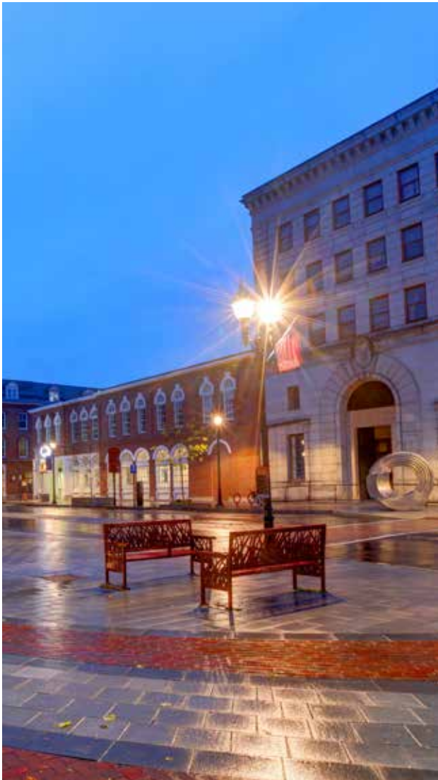
Main Street service.